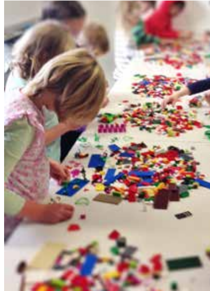
ABOVE: Children enjoying Lego play at the Yackandandah library.