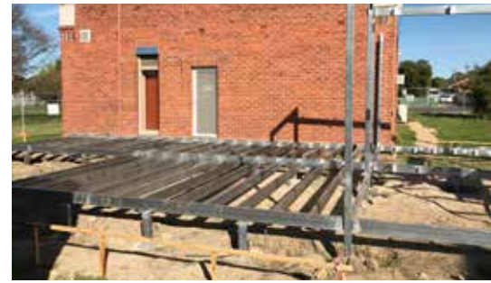
ABOVE: Work has started in earnest on the Chiltern Early Years Hub. The maternal and child health nurse is operating from Indigo North Health at 11 Main Street, Chiltern. Construction is scheduled for completion on 22 December, and enrolments for 2018 are being received.