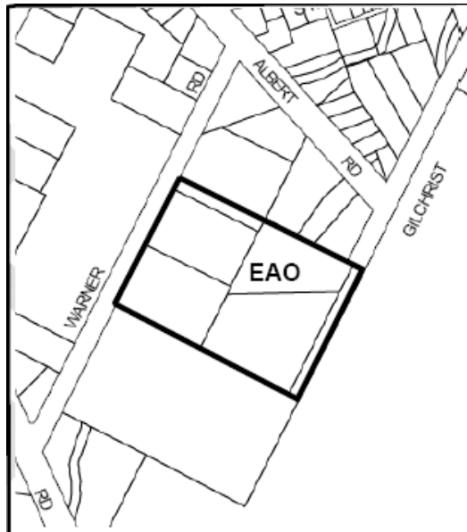
Figure 3: Proposed Environmental Audit Overlay

The amendment further proposes to introduce the Environmental Audit Overlay (EAO) to cover that part of the site primarily occupied by the Old Beechworth Hospital infrastructure including the diesel underground storage tank and old boiler room and the maintenance services (including chemical stores) as identified within the Due Diligence Environmental Site Assessment. This proposed overlay is shown in Figure 3.