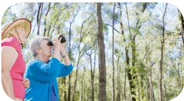
● Our natural environment is an integral part of our life in Indigo.